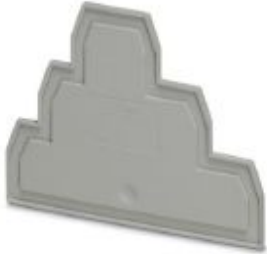
End cover, length: 90 mm, width: 2.2 mm, height: 69.8 mm, color: gray

Please be informed that the data shown in this PDF Document is generated from our Online Catalog. Please find the complete data in the user's documentation. Our General Terms of Use for Downloads are valid ( http://phoenixcontact.com/download )