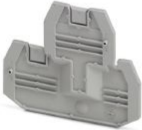
End cover, length: 69.9 mm, width: 2.2 mm, height: 57.5 mm, color: gray

Please be informed that the data shown in this PDF Document is generated from our Online Catalog. Please find the complete data in the user's documentation. Our General Terms of Use for Downloads are valid ( http://phoenixcontact.com/download )