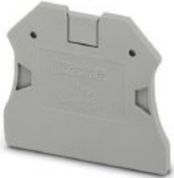
End cover, length: 47 mm, width: 2.2 mm, height: 39.8 mm, color: gray

Please be informed that the data shown in this PDF Document is generated from our Online Catalog. Please find the complete data in the user's documentation. Our General Terms of Use for Downloads are valid ( http://phoenixcontact.com/download )