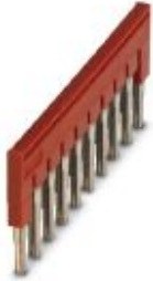
Plug-in bridge, pitch: 6.2 mm, width: 60.3 mm, number of positions: 10, color: red

Please be informed that the data shown in this PDF Document is generated from our Online Catalog. Please find the complete data in the user's documentation. Our General Terms of Use for Downloads are valid ( http://phoenixcontact.com/download )