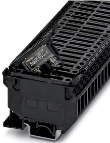
Fuse terminal block for cartridge fuse insert, cross section: 0.2 - 4 mm 2 , AWG: 26 - 10, width: 8.2 mm, color: black

Please be informed that the data shown in this PDF Document is generated from our Online Catalog. Please find the complete data in the user's documentation. Our General Terms of Use for Downloads are valid ( http://phoenixcontact.com/download )