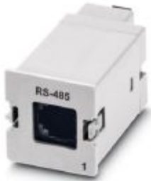
RS-485 connection for data transfer or software configuration

Please be informed that the data shown in this PDF Document is generated from our Online Catalog. Please find the complete data in the user's documentation. Our General Terms of Use for Downloads are valid ( http://phoenixcontact.com/download )