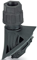
EVO plastic cable gland with bayonet locking, for housing series B, size M20, cable diameter: 7 ... 13 mm

Please be informed that the data shown in this PDF Document is generated from our Online Catalog. Please find the complete data in the user's documentation. Our General Terms of Use for Downloads are valid ( http://phoenixcontact.com/download )