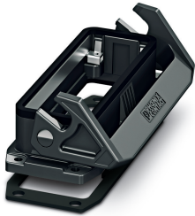
HEAVYCON EVO panel mounting base, plastic, B24, with single locking latch, height: 30.5 mm, with flat gasket

Please be informed that the data shown in this PDF Document is generated from our Online Catalog. Please find the complete data in the user's documentation. Our General Terms of Use for Downloads are valid ( http://phoenixcontact.com/download )