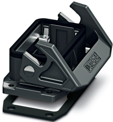
HEAVYCON EVO panel mounting base, plastic, B10, with single locking latch, height: 30.5 mm, with flat gasket

Please be informed that the data shown in this PDF Document is generated from our Online Catalog. Please find the complete data in the user's documentation. Our General Terms of Use for Downloads are valid ( http://phoenixcontact.com/download )