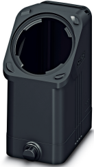
HEAVYCON EVO sleeve housing, plastic, with bayonet flange for EVO screw connection, B10, for single locking latch, height: 87.5 mm, without EVO screw connection

Please be informed that the data shown in this PDF Document is generated from our Online Catalog. Please find the complete data in the user's documentation. Our General Terms of Use for Downloads are valid ( http://phoenixcontact.com/download )