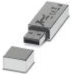
USB memory stick, 8 GB

USB memory stick - USB FLASH DRIVE - 2402809