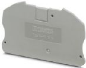
End cover, length: 75.4 mm, width: 2.2 mm, height: 45.6 mm, color: gray

Please be informed that the data shown in this PDF Document is generated from our Online Catalog. Please find the complete data in the user's documentation. Our General Terms of Use for Downloads are valid ( http://phoenixcontact.com/download )