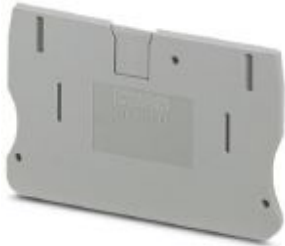
End cover, length: 67.7 mm, width: 2.2 mm, height: 42.6 mm, color: gray

Please be informed that the data shown in this PDF Document is generated from our Online Catalog. Please find the complete data in the user's documentation. Our General Terms of Use for Downloads are valid ( http://phoenixcontact.com/download )