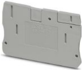
End cover, length: 57.7 mm, width: 2.2 mm, height: 36 mm, color: gray

Please be informed that the data shown in this PDF Document is generated from our Online Catalog. Please find the complete data in the user's documentation. Our General Terms of Use for Downloads are valid ( http://phoenixcontact.com/download )