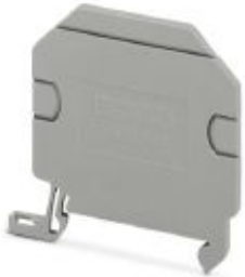
Partition plate, length: 53.4 mm, width: 2.2 mm, height: 45.7 mm, color: gray

Please be informed that the data shown in this PDF Document is generated from our Online Catalog. Please find the complete data in the user's documentation. Our General Terms of Use for Downloads are valid ( http://phoenixcontact.com/download )