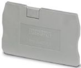
End cover, length: 48.6 mm, width: 2.2 mm, height: 29.1 mm, color: gray

Please be informed that the data shown in this PDF Document is generated from our Online Catalog. Please find the complete data in the user's documentation. Our General Terms of Use for Downloads are valid ( http://phoenixcontact.com/download )