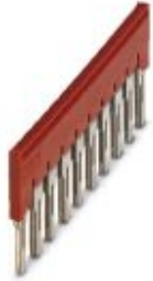
Plug-in bridge, pitch: 8.2 mm, width: 80.3 mm, number of positions: 10, color: red

Please be informed that the data shown in this PDF Document is generated from our Online Catalog. Please find the complete data in the user's documentation. Our General Terms of Use for Downloads are valid ( http://phoenixcontact.com/download )