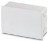
Replacement cover for base unit