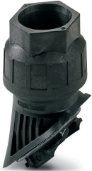
EVO plastic cable gland with bayonet locking, for housing series B, size M40, cable diameter: 19 ... 28 mm

Please be informed that the data shown in this PDF Document is generated from our Online Catalog. Please find the complete data in the user's documentation. Our General Terms of Use for Downloads are valid ( http://phoenixcontact.com/download )