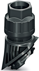
EVO plastic cable gland with bayonet locking, for housing series B, size M32, cable diameter: 11 ... 21 mm

Please be informed that the data shown in this PDF Document is generated from our Online Catalog. Please find the complete data in the user's documentation. Our General Terms of Use for Downloads are valid ( http://phoenixcontact.com/download )