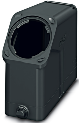
HEAVYCON EVO sleeve housing, plastic, with bayonet flange for EVO screw connection, B24, for single locking latch, height: 87.5 mm, without EVO screw connection

Please be informed that the data shown in this PDF Document is generated from our Online Catalog. Please find the complete data in the user's documentation. Our General Terms of Use for Downloads are valid ( http://phoenixcontact.com/download )