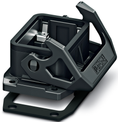
HEAVYCON EVO panel mounting base, plastic, B6, with single locking latch, height: 30.5 mm, with flat gasket

Please be informed that the data shown in this PDF Document is generated from our Online Catalog. Please find the complete data in the user's documentation. Our General Terms of Use for Downloads are valid ( http://phoenixcontact.com/download )