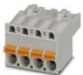
PCB connector, nominal cross section: 2.5 mm 2 , color: light gray, nominal current: 12 A, rated voltage (III/2): 320 V, contact surface: Tin, type of contact: Female connector, Number of potentials: 3, Number of rows: 1, Number of positions per row: 3, number of connections: 3, product range: FKCT 2,5/..-ST, pitch: 5 mm, connection method: Push-in spring connection, conductor/PCB connection direction: 0 °, Stecksystem: CLASSIC COMBICON, Locking: without, type of packaging: packed in cardboard

Printed-circuit board connector - FKCT 2,5/ 3-ST KMGY - 1998263